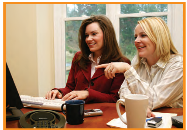
Big office sound at a small office price