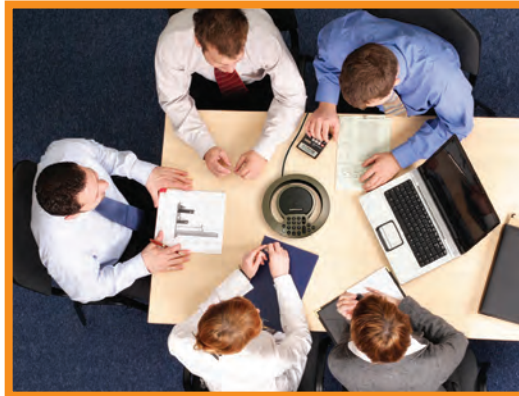
Crisp and clear so everyone can be heard