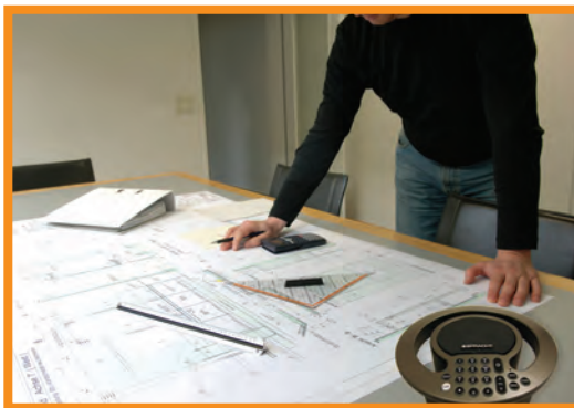
Volume & clarity for your office conference calls