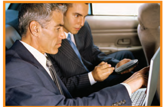
Take important calls while in traffic