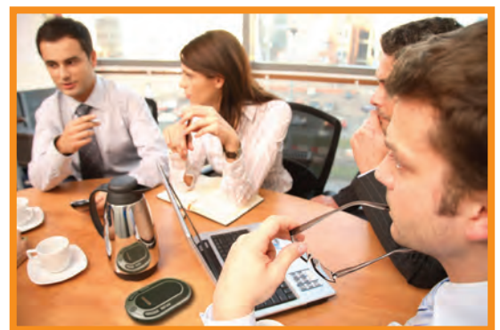
Even VoIP calls will sound professional