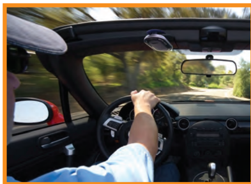
Free both hands for driving